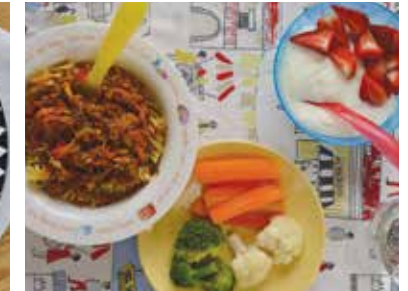
Dinner • Pasta and bolognese sauce • Cooked vegetables • Fresh fruit and yoghurt

An example of a days food for a 2-3 year old