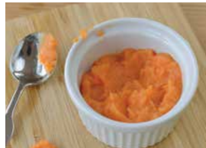
Pureed sweet potato