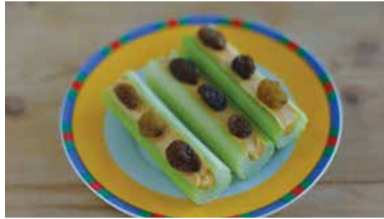
Celery sticks filled with peanut butter and sultanas*

Fruit and vegetables in season are usually more affordable.