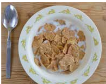
Breakfast • Wholegrain cereal flakes with milk

An example of a days food for a 2-3 year old