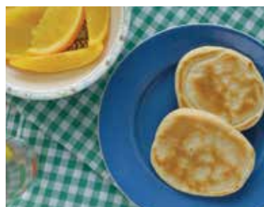
Snack • Pikelets • Fresh fruit