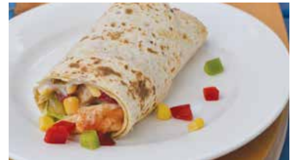
Easy Mexican tortilla wrap