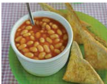
Breakfast • Baked beans • Wholegrain toast

An example of a days food for a 4-8 year old