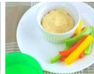
Snack • Vegetable sticks and hommus dip