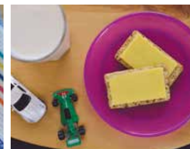
Snack • Cup of reduced-fat milk • Wholegrain crackers and cheese