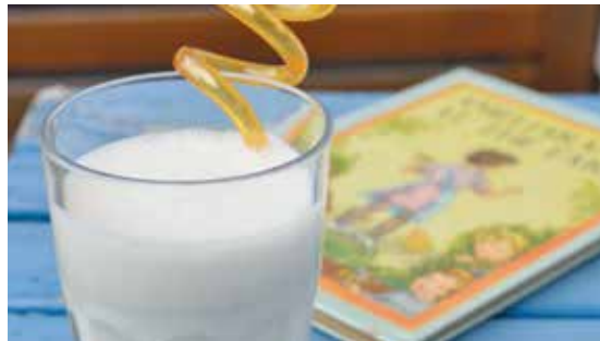
Cup of milk