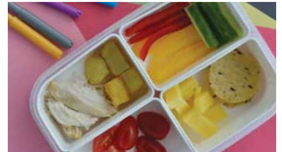
Slices of cold roast meat, cheese, cherry tomatoes and cucumber slices