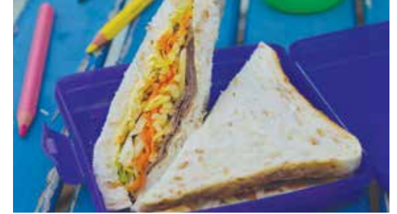
Roast meat, lettuce, carrot and cheese sandwich

Use a frozen ice brick and insulated lunch box.