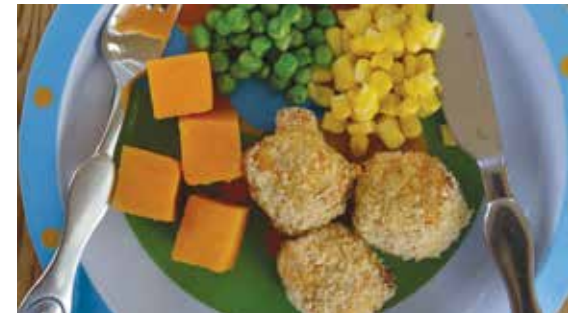
Homemade chicken nuggets