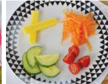
Snack • Sliced vegetables • Cheese