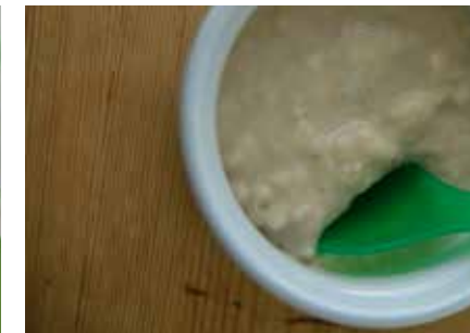
Blended tuna casserole