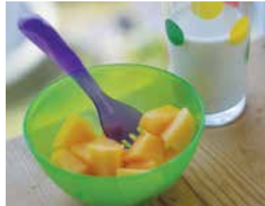
Snack • Fresh fruit • Small cup of full-cream milk