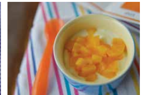
Fruit and yoghurt