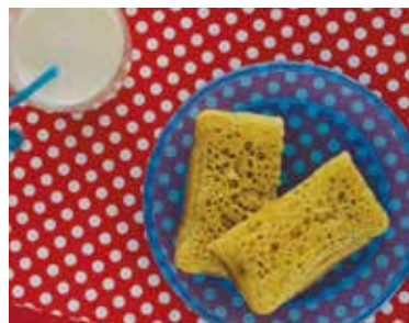
Snack • Crumpet • Small cup of milk