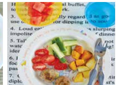
Dinner • Homemade hamburger • Oven-baked potatoes and pumpkin • Salad vegetables • Fresh fruit

An example of a days food for a 4-8 year old