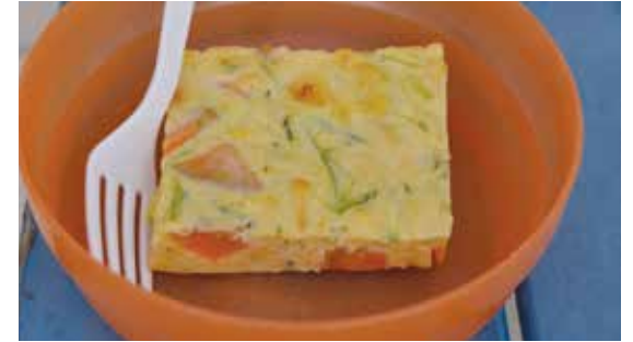
Vegetable and egg slice