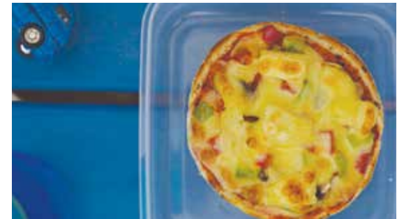
English muffin topped with cheese, pineapple and ham