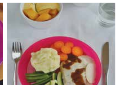
Dinner • Roast chicken • Mashed potato • Cooked vegetables • Canned fruit and custard