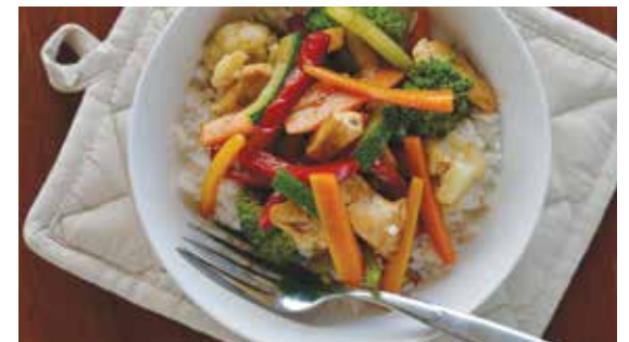
Stir fried chicken with vegetables and rice