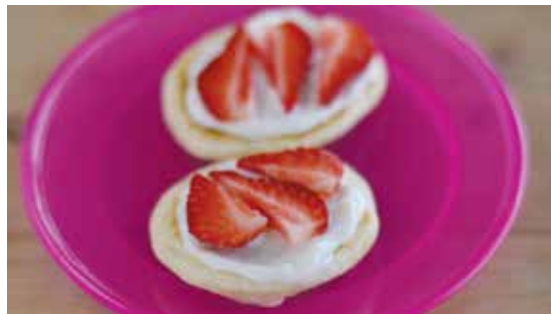
Pikelets topped with berries and yoghurt