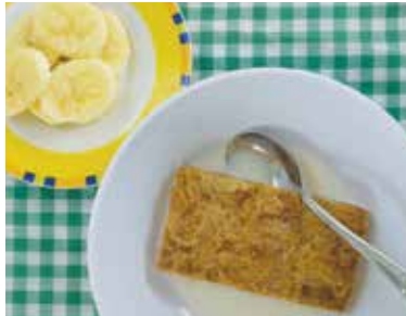
Breakfast • Breakfast biscuit with full-cream milk • Fresh fruit

An example of a days food for a 1-2 year old