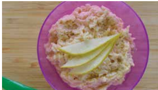
Porridge with canned or fresh fruit