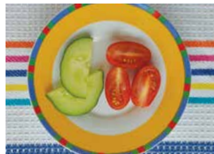
Cherry tomatoes and cucumber slices