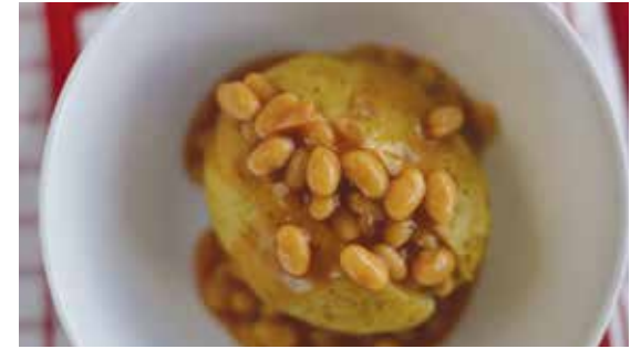
Jacket potato topped with baked beans

It is okay to use store-bought items like tomato pasta sauce, pizza bases or roast chicken to save time.