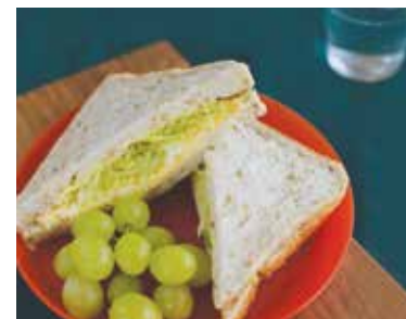
Lunch • Egg and lettuce sandwich • Fresh fruit