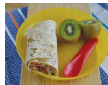
Lunch • Tuna and salad wrap • Fresh fruit