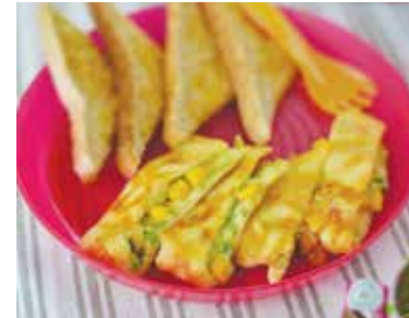
Lunch • Vegetable omelette • Toast