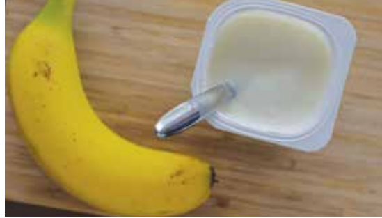
Fresh fruit and yoghurt