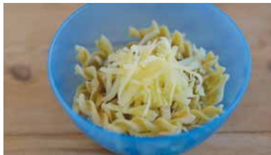
Cooked pasta spirals and grated cheese