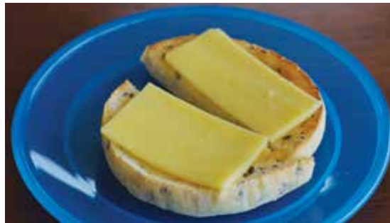
Toasted English muffin with cheese