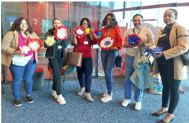
Partners program attendees with their dahlia creations from the Devonport Regional Gallery tour